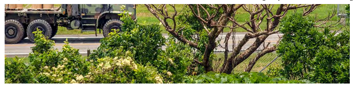
Out with the old, in with the new From top to bottom: A guard protects the site of the new American military base in Henoko. The American invasion of Okinawa. The current Futenma base is due to be replaced by the Henoko project

When Gushiken finds human remains, he must first contact the local police to confirm that they are not related to a crime under investigation. The bones are then moved to an interim storage facility at the memorial cemetery in Okinawa, a cramped building next to a tool shed overlooking the southern coast of the island. "As you can tell, the room is very small," the head of the prefecture's bone-collection division told me when I visited. "We want a proper building."