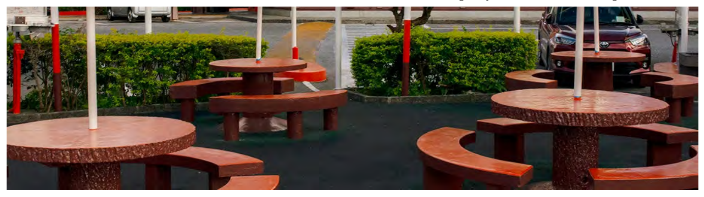
Occupation From top to bottom: An old entertainment district for the US military near Camp Schwab, an American base on Okinawa. Raising the flag in 1945. Camp Kinser, one of many bases on the island

For many Okinawans, the Henoko project, which will replace Marine Corps Air Base Futenma, another American military installation, epitomises their unjust treatment. Even after the reversion to Japan, politicians from the mainland have been happy to keep American troops concentrated there, away from the vast majority of their voters; many Okinawan elites have found ways to profit from their presence, raking in subsidies and lucrative construction contracts. The island, which comprises less than 1% of Japan's land mass, is home to about half the American troops stationed in the country – around 25,000 soldiers. The roar of fighter jets and helicopters has become part of the local soundscape, along with the lapping of waves and the chirping of the Ryukyu robin.